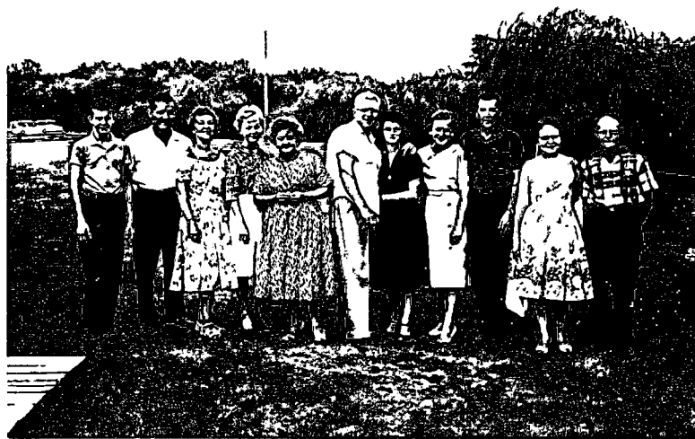
Mundelein Contest Winners at MGC Picnic Aug. 26, '61 at Butler Lake